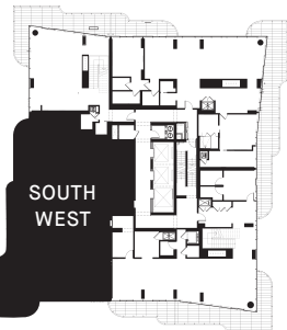
75 TH FLOOR