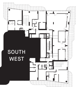
76 TH FLOOR